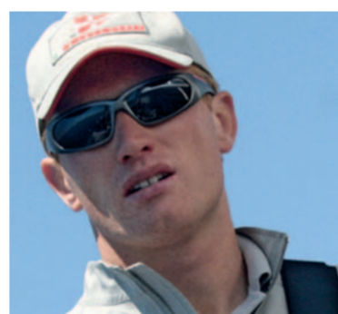
James Spithill Helmsman Luna Rossa Challenge

We didn't think the race was won at the start but as it turned out the pressure came in nicely from the right hand side and there was a right hand shift and that side of the course was favoured about 85% of the time and they were on the correct side. They did a nice job downwind despite our efforts to out gybe them. There were fewer opportunities with one side being so favoured. They sailed as the conditions dictated, they sailed really well in the shifty stuff. Today was more consistent and they were able to play the tight game.