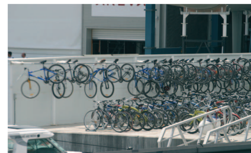
BIKE RACKS AT ONE OF THE TEAM BASES

The America's Cup Parks and harbour has some 1 million sq. meters and the distance from one side of the harbour to the other is over 6 kms. A cycle lane has been built all around the entire stadium of sailing complex. Have a look at any of the team bases and they have assembled bike racks stacked high with an assortment of bone shakers, recumbents, mountain bikes and ordinary road bikes, it looks like a scene from Amsterdam. Cycle lanes have also been installed in some of the main boulevards in and out of town like in Avenida del Puerto and Avenida de Francia, and on any evening after racing you'll see swarms of team members cycling home along the Paseo Maritimo to their apartments along the beach. Bike shops have sprung up around the city to support the new explosion in demand and there are a number of bike hire facilities all round the port of America's Cup, so what's stopping you, 2 wheels are better than 4 and cycling is a great form of exercise.