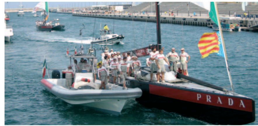
RACE 3, IL FILM DELLA REGATA LUNA ROSSA

SEMI FINAL B, AFTER 3 RACES: BMW ORACLE RACING: 1 POINT - LUNA ROSSA CHALLENGE: 2 POINTS