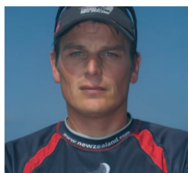
Dean Barker Helmsman Emirates Team New Zealand

A day of stable sailing conditions when the Spanish team recorded their first win in style imposing a penalty on Team New Zealand in the pre-start while Luna Rossa dominated the start against BMW Oracle going on to take a comfortable lead and cover all the way to the finish. Luna Rossa had led Oracle around every mark of the semi finals to date