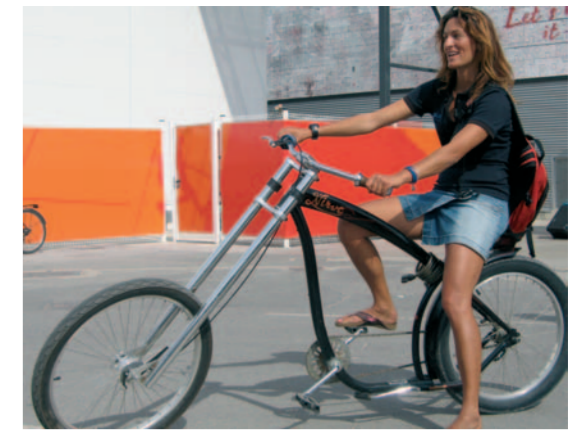
VALENCIA, GOES BIKE CRAZY

www.lunarossa.challenge.com il sito dove trovare tutti i numeri arretrati di Luna Rossa - Il Giornale della Coppa